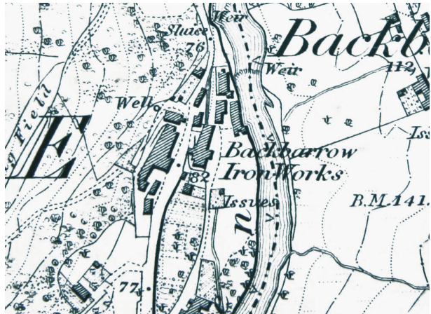
Backbarrow, OS Sheet VIII, Lancashire, c.1848