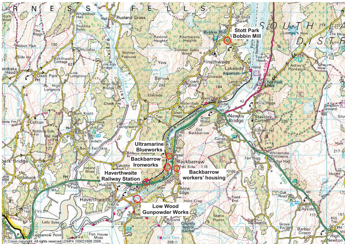
Leven Valley, OS Landranger 96, 2007