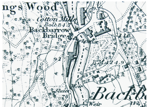
Blueworks site, OS Sheet VIII, Lancashire, c.1848