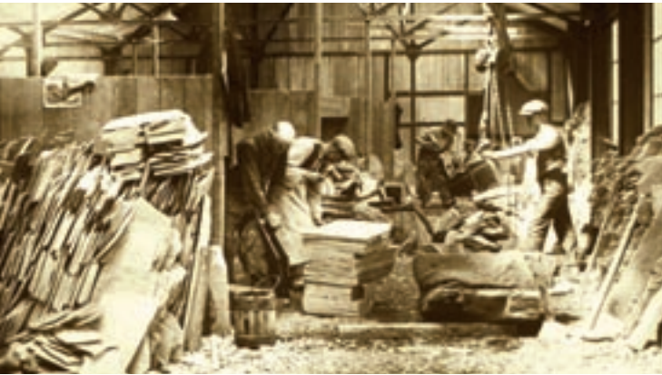
Finishing slate at Honister in the early 1900s