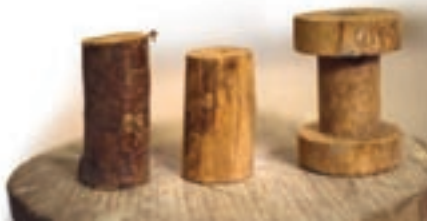
Wooden bobbins made at Stott Park Bobbin Mill

They're your key to unlocking the Lake District's past and understanding its present.