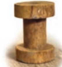
Bobbin from Stott Park Bobbin Mill

Working together for a prosperous economy, vibrant communities and world class visitor experiences - and all sustaining the spectacular landscape.